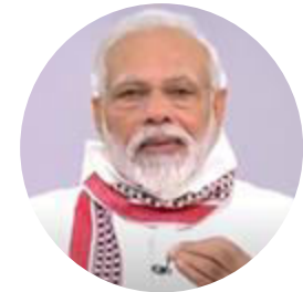
Prime Minister Shri Narendra Modi